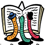
Session Records Review

The Clerks of Sessions within our Presbytery review each other's Session minutes annually. Three regional meetings for this purpose are scheduled in early 2008: Morganton First Presbyterian Church on Saturday, March 8 th , Canton Presbyterian Church on Saturday, May 17 th and Shelby Presbyterian Church on Saturday, June 7 th .