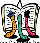
Session Records Review