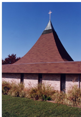
Northminster Presbyterian Church

All Events on Sunday will be held in the Fellowship Hall of Northminster Presbyterian Church.