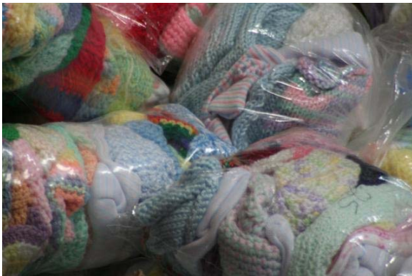
Crocheted and knitted baby caps